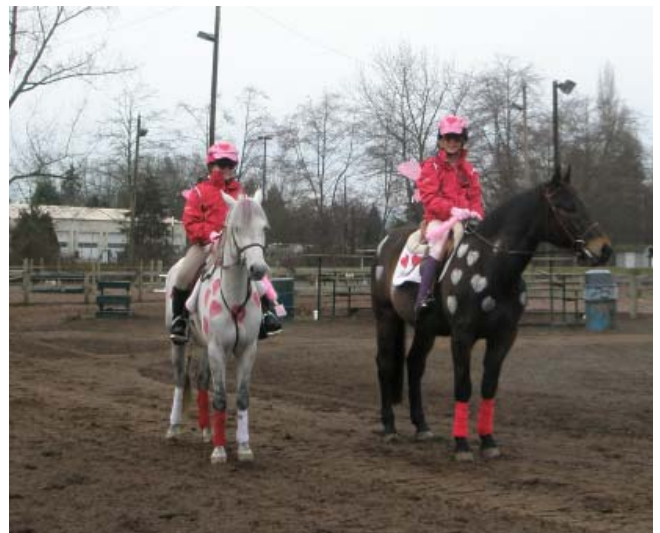
The Valentine's Playday was such a success that another (St. Patrick's Day) Playday is planned for March 15.